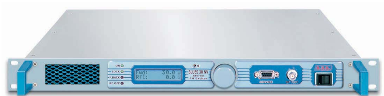
BLUES30NV front view