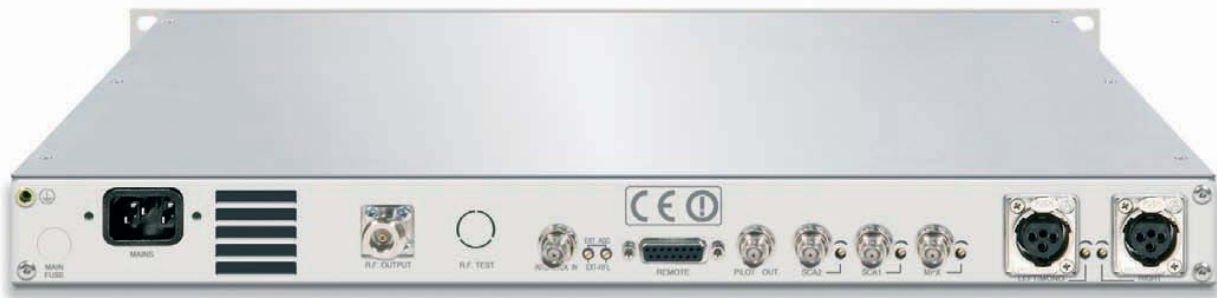
BLUES30NV rear view