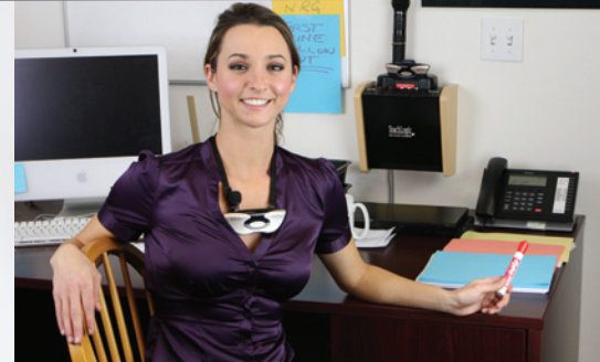
Result: Another happy teacher with an organized classroom