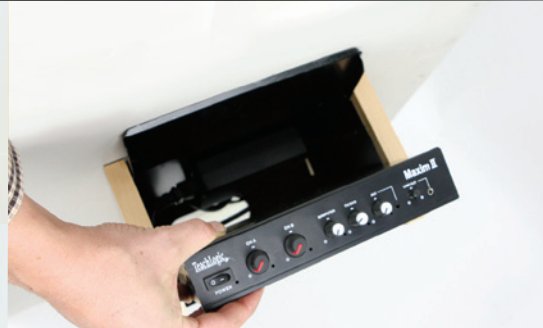
Maxim II or VoiceLink II easily drop into place